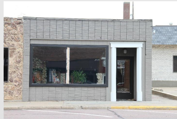
112 E. Main St.