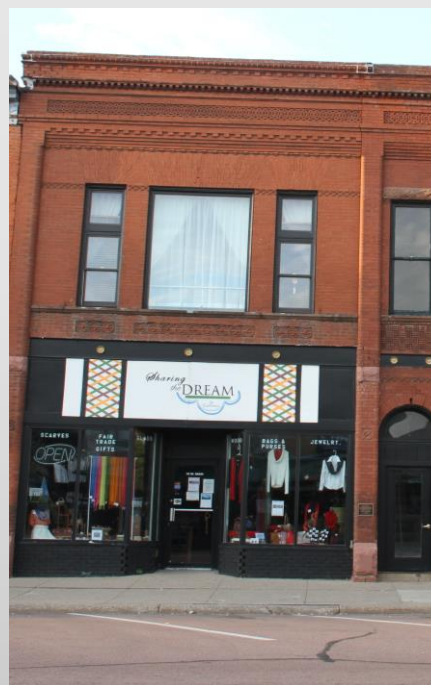
10 W. Main St.