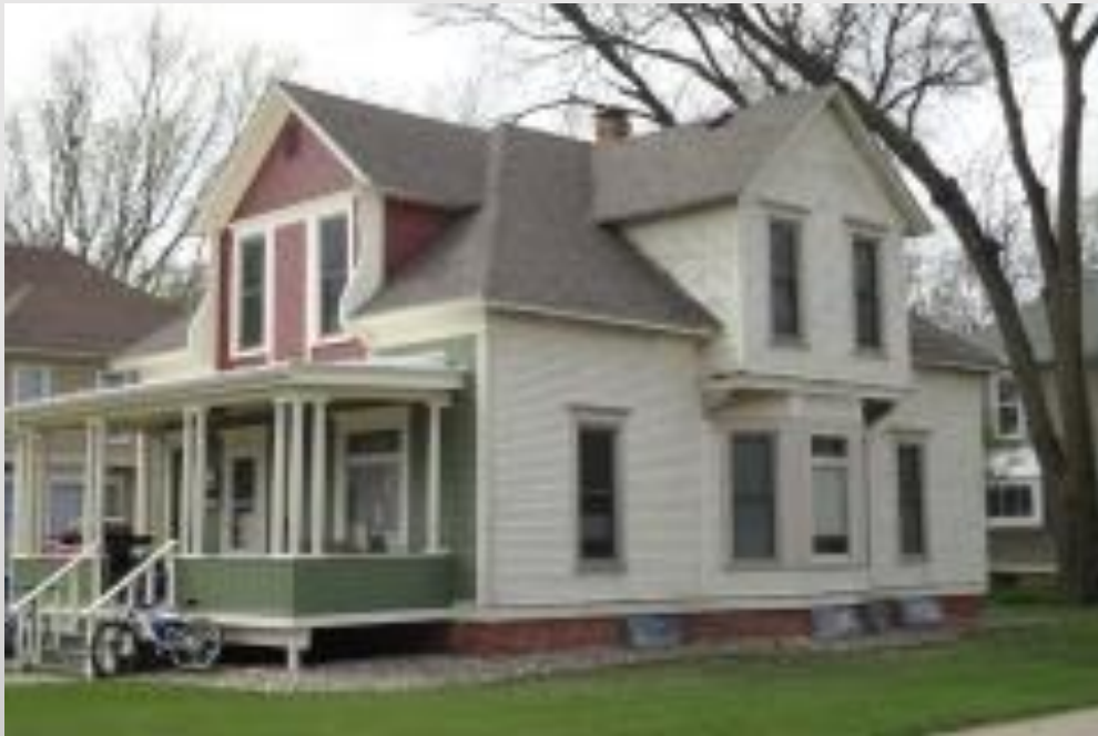
Photograph by Lynn Muller, 2017