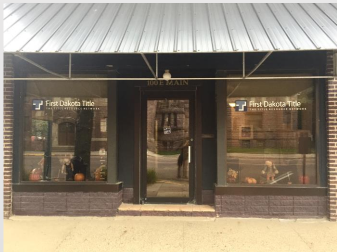
10 E. Main St.