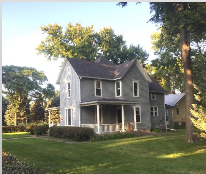
225 N. University