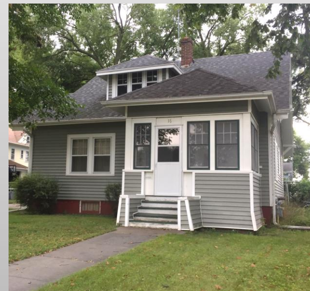
15 E. Bloomingdale